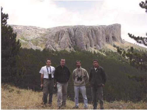
In the Moncayo Natural Park

During 2004, contact was established with several organizations, aiming at potential future projects for Territorios Vivos (proceeding):