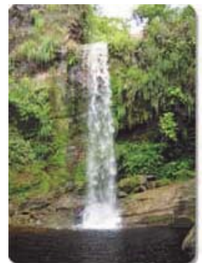
Views of N.P. Kaa-Iya, Bolivia, where we perform our first international project.

This project involves the design and improvement of an interpretation path in the buffer zone of this national park, with environmental education and ecotouristic purposes. In both stages, design and improvement, the local population will play a key role, who will in the end be responsible for the public use management of this path. They will receive assistance from the Capitanía del Alto y Bajo Isozo (CABI), a locally-based organization with competences in the management of this natural protected area.